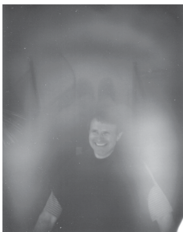
Fig. 1-3 Photographs of the subtle energies around the physical body (originals in colour)